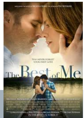
Best of Me Trailer

Shortly after a question and answer period the ISU Film Producers Club will screen, Spark's "The Best of Me" which is now a popular motion picture, starring James Marsden and Michelle Monaghan.