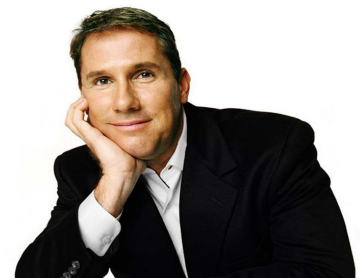
Nicholas Spark - Homepage